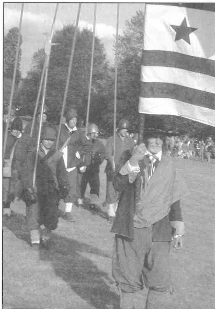
Sealed Knot marching to battle

Your help needed! The Youth Centre Management Committee is desperately seeking a Chairman and Treasurer. The current Chairman has been in post for over ten years and wishes to retire. The Clerk to the Parish Council acts as Secretary to the Management Committee and is currently also acting Treasurer. Anyone willing to relieve her of the Treasurer's post would be welcomed with open arms.