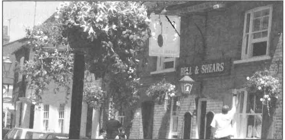
The High Street in bloom

Achieving Quality Parish status demonstrates that a council has met certain minimum standards expected from an effective, representative and active parish council. The scheme is voluntary and is open to all parish councils in England. It is hoped that a