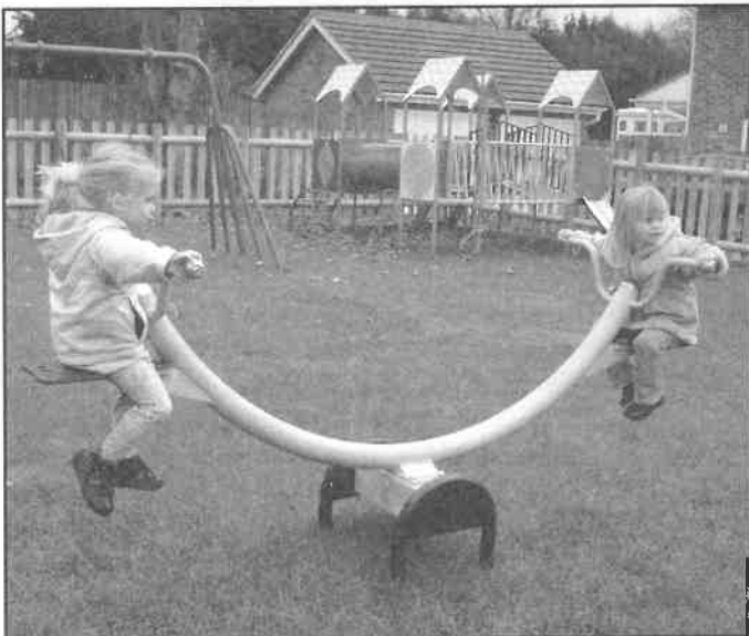
Two friends enjoying the new facility

The Redbourn Parish Council also holds development funds for Redbourn Village Hall, the Bowling Green Project, Youth Centre, Redbourn Care Group Minibus, Scout Hut, Museum, Tennis Club and St Mary's Church Hall. We work in close liaison with village organisations and have representation on most of their committees.