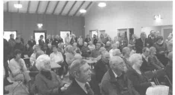
Guests listen to speeches by the Chairman of the Parish Council and The Mayor of St Albans