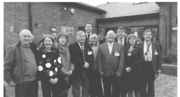
A proud moment for the Parish Council