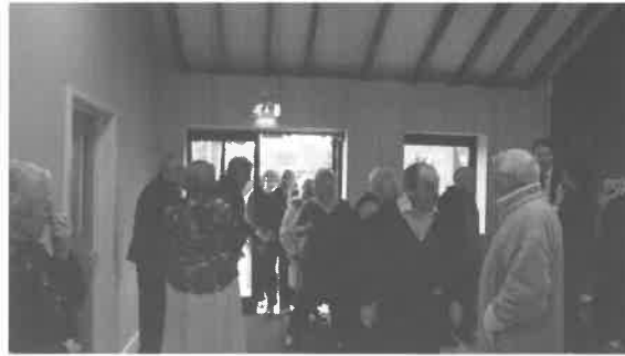
Guests arriving for the opening ceremony and a tour of the building