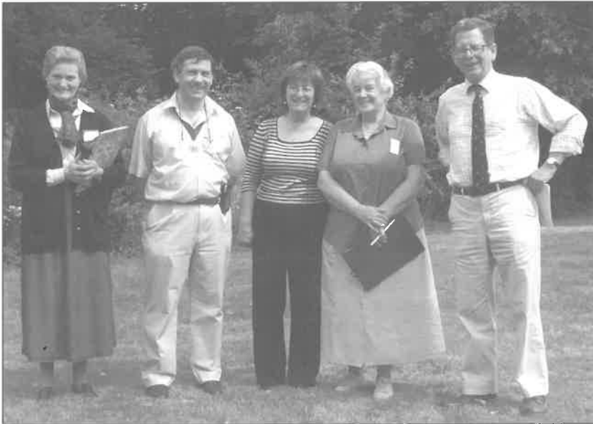
The Village of the Year judges, with Parish Clerk and Chairman