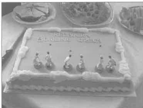
The Commemorative Cake

or call the Recreation Centre on 01582 626202